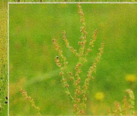
Sheep Sorrel flowers