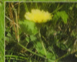
Mouse Ear Hawkweed