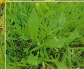
Sheep Sorrel leaves